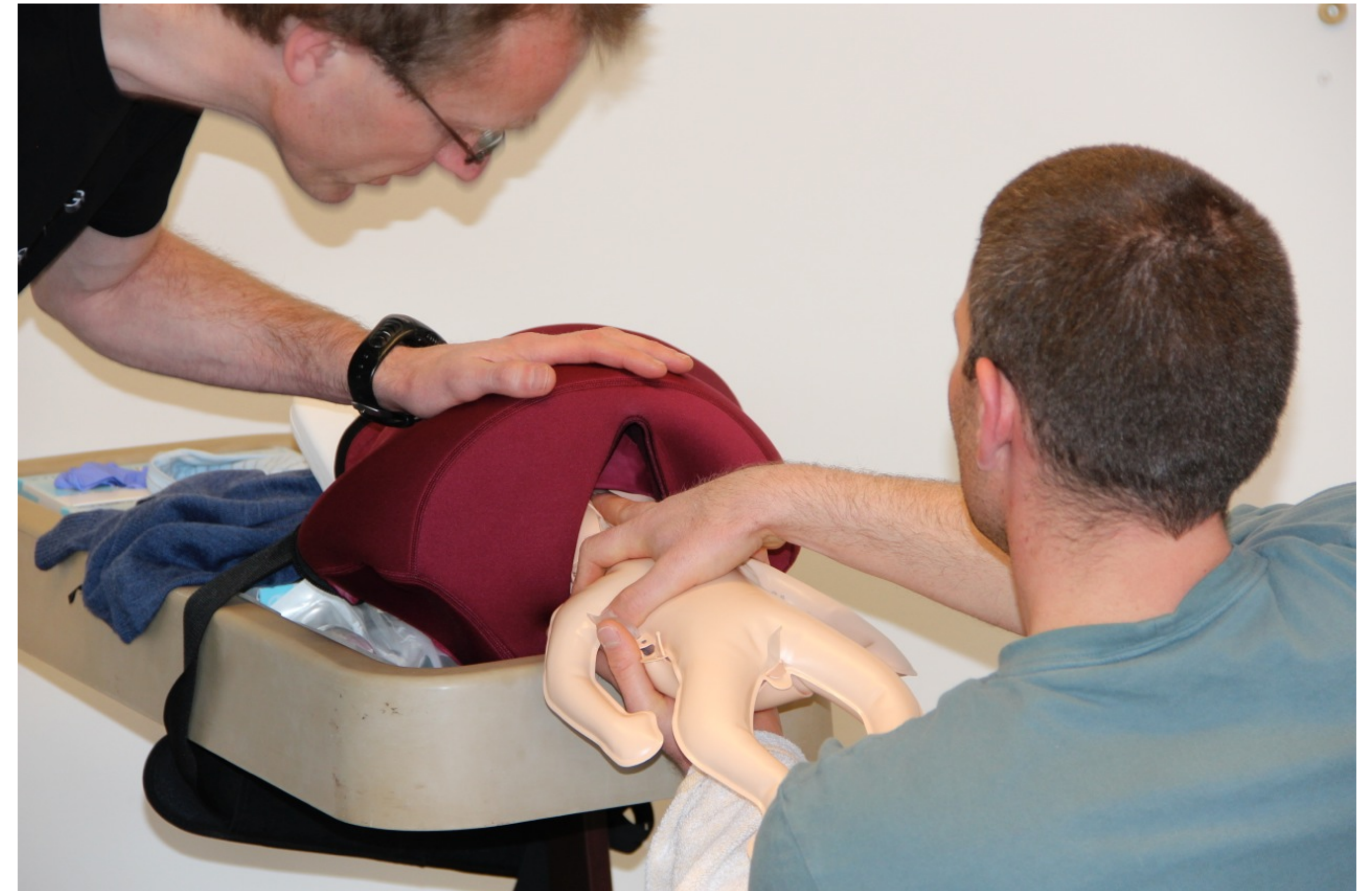
Fig. 3. Cours POET 2012

The greatest challenge is to translate the different handbooks and adapt the UK recommendations to our local practices without altering the meaning.