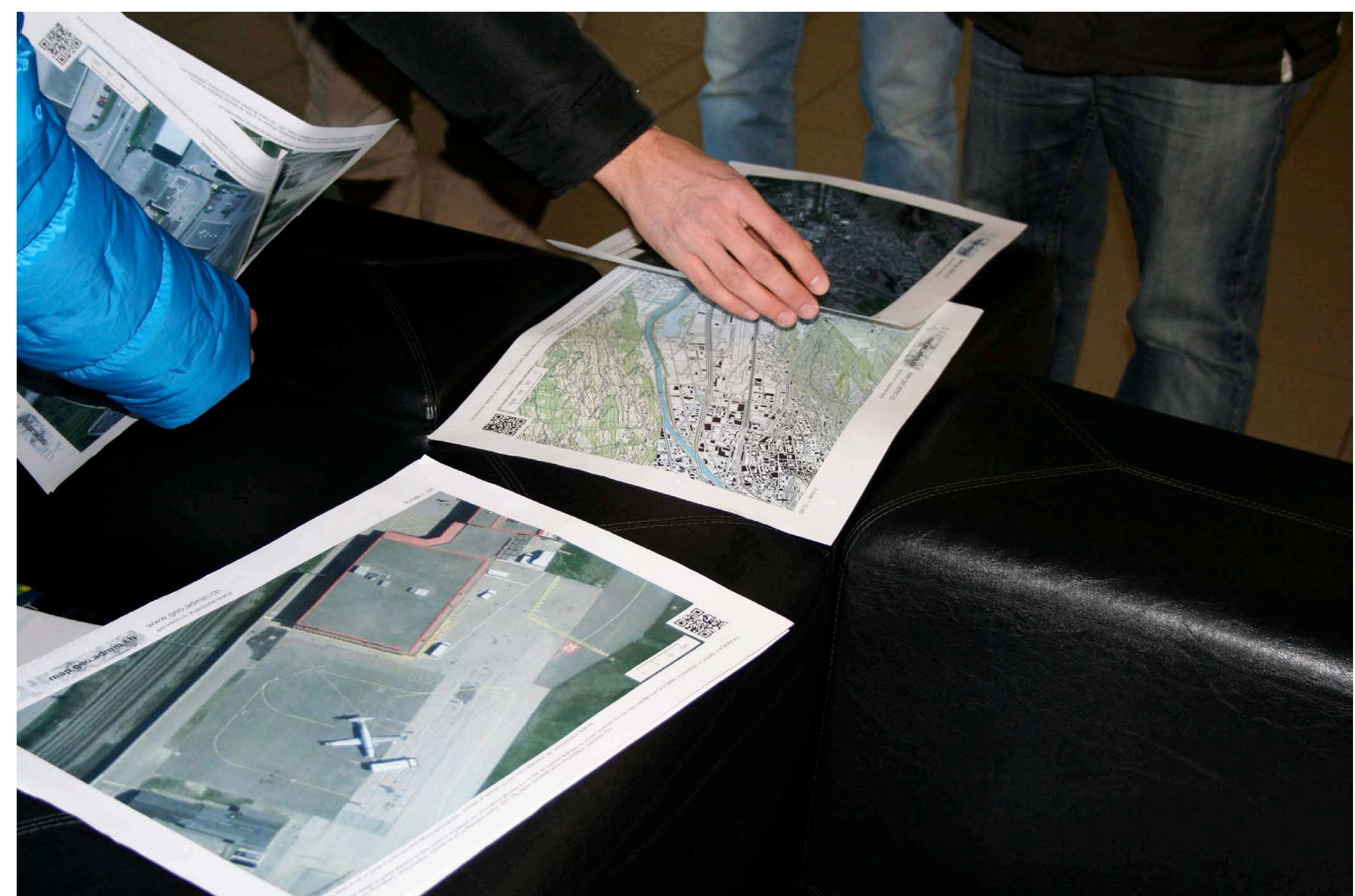
Fig. 2. Cours MIMMS 2013

<< . . . and it is often an excuse to ourselves that we imagine that things are impossible >> (François de la Rochefoucauld)