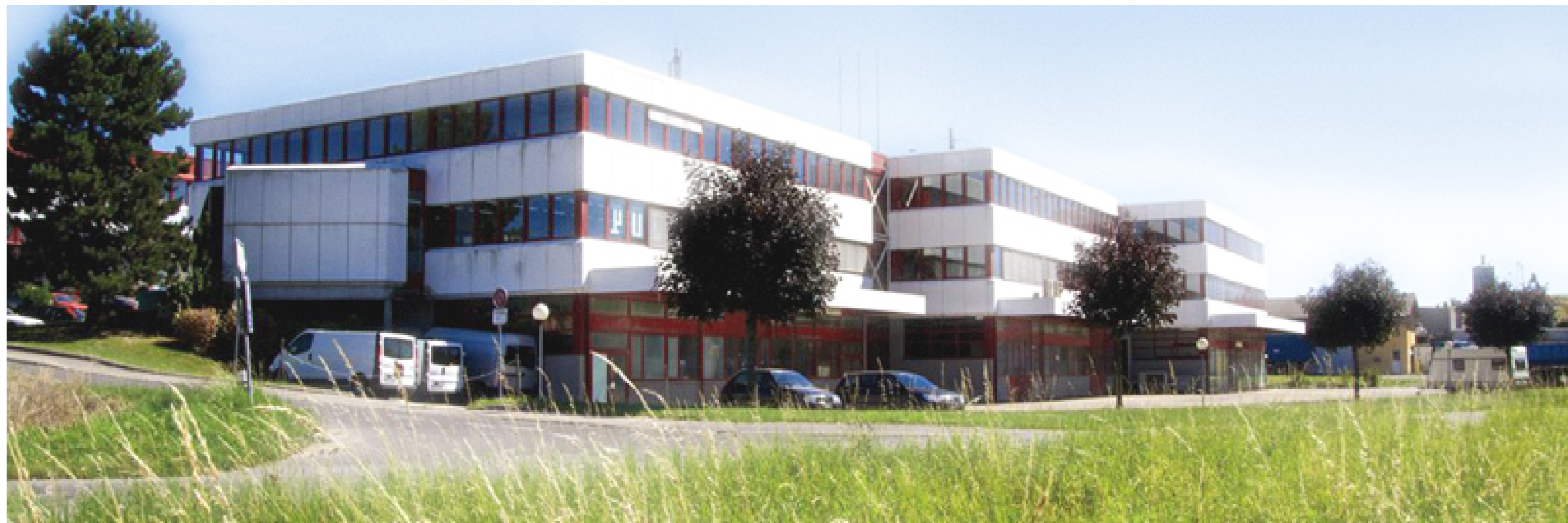
Fig. 1. ES ASUR, en Budron C8, 1052 Le Mont-sur-Lausanne

The ES ASUR is a College of Higher Vocational Education. It offers advanced professional training on a full-time basis combined with work experience in pre-hospital and hospital units.